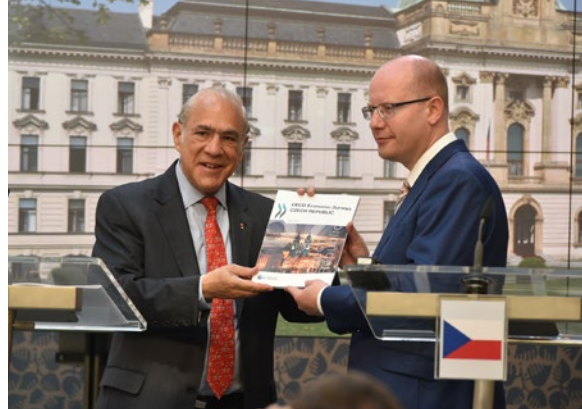
Presentation of the Economic Survey of the Czech Republic 2016 on 6 June, with Prime Minister Bohuslav Sobotka and OECD Secretary-General Ángel Gurría

The OECD recently published several reports on the Czech Republic's policies. Member countries have reviewed and approved the recommendations, on an equal basis.